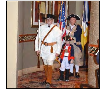
Color Guard retrieving the Colors.