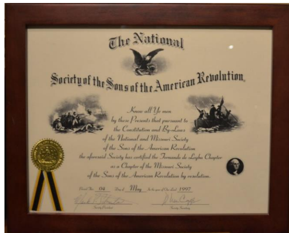
Replacement Charter (Original was lost.)