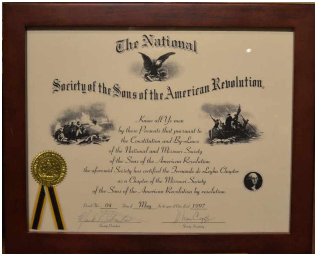
Replacement Charter (Original was lost.)