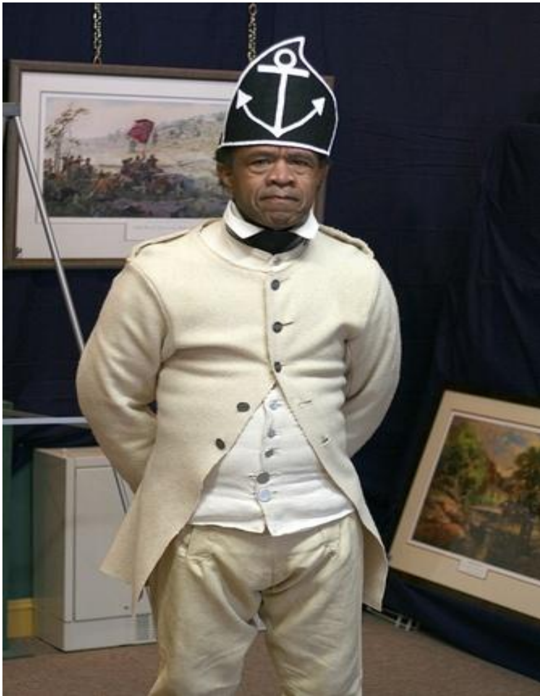
THIS PICTURE SHOWS THE UNIFORM OF THE 1ST RHODE ISLAND REGIMENT